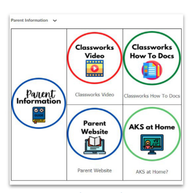
Parent Video and How-To

Once on the Digital Summer Enrichment and Acceleration eCLASS page, parents and students will find information on how to access the lessons in Classworks and support for learning from home.