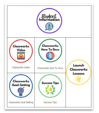
Student Video and How-To

On the Student Portal, go to Additional Resources to find a link for the Digital Summer Enrichment+Acceleration eCLASS page.